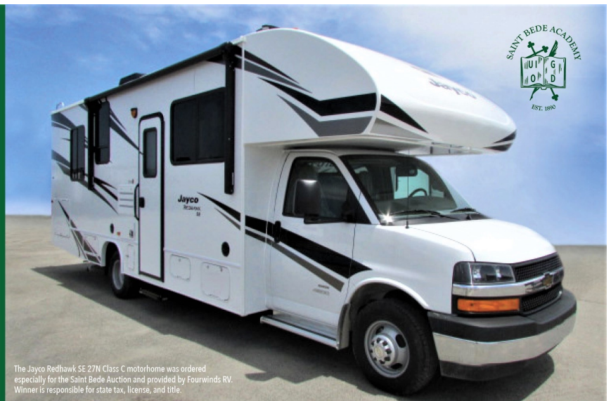
The Jayco Redhawk SE 27N Class C motorhome was ordered especially for the Saint Bede Auction and provided by Fourwinds RV. Winner is responsible for state tax, license, and title.

HELP US SPREAD THE WORD ABOUT THIS INCREDIBLE OPPORTUNITY!