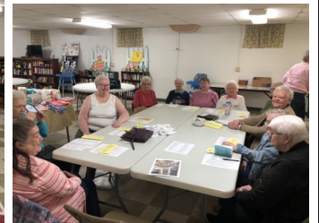
Tiskilwa Community Women's Group

Save the Date! The next Mom's Night Out event will be held on Friday, May 5th from 6-9PM. Come and enjoy some adult drinks and shopping, plus free childcare!